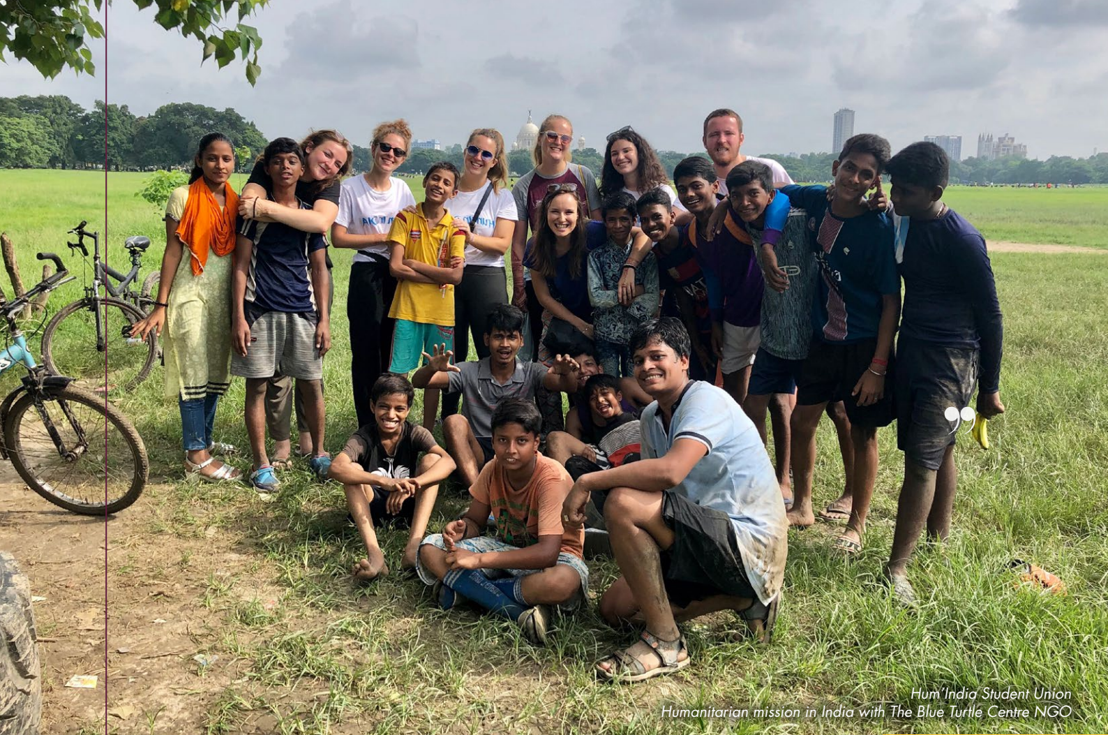
Hum'India Student Union Humanitarian mission in India with The Blue Turtle Centre NGO