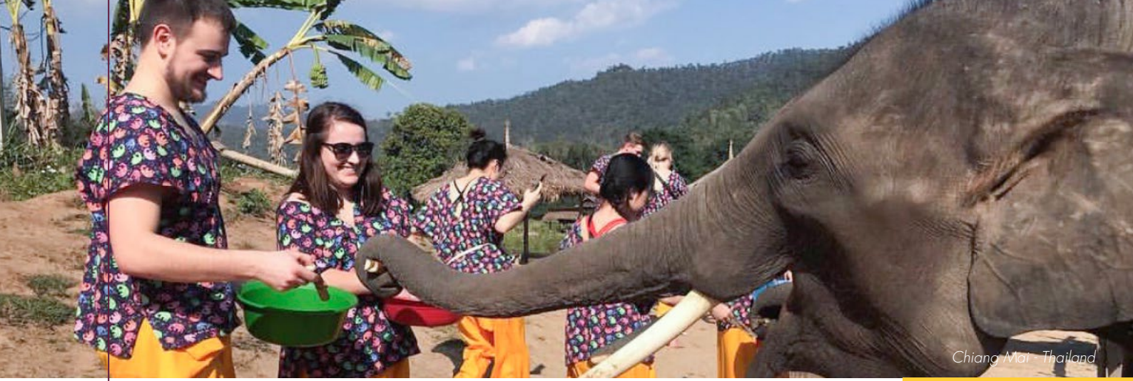
Chiang Mai - Thailand